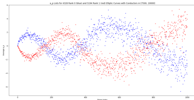
FIGURE 2. Distribution of averages of a_p 's of elliptic curves of rank 0 (blue) and 1 (red) with conductors in [7\,500, 10\,000] . The figure is sourced from [HLOP22].

Interestingly, the locations of the first few local maxima can be fairly precisely predicted. In the conductor range [N, N + 10\sqrt{N}] , the first local maximum is at around B = 0.08N , the second one is at B = 0.65N , and the third one is at B = 1.7N . For an illustrative demonstration of this phenomena, please refer to the animation [BK24] that presents the supplementary material for this manuscript.